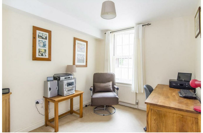
Double glazed window to rear. Built-in wardrobe. Radiator.