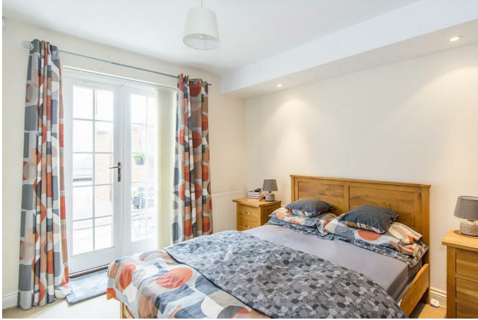
Double glazed French doors to the rear of the building. Built-in wardrobe. Radiator.