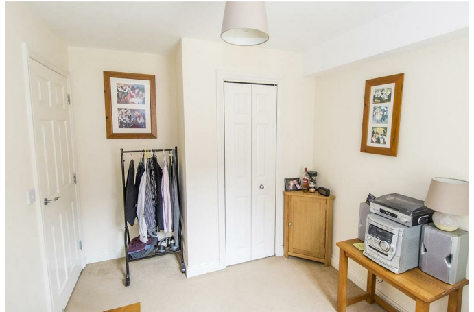
(Bedroom Two Photo Two)