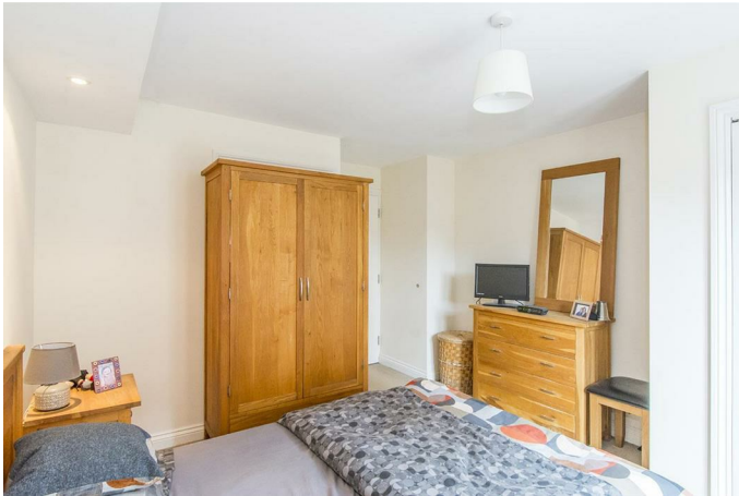
(Master Bedroom Photo Two)